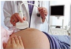
Transducer (probe) on the abdomen